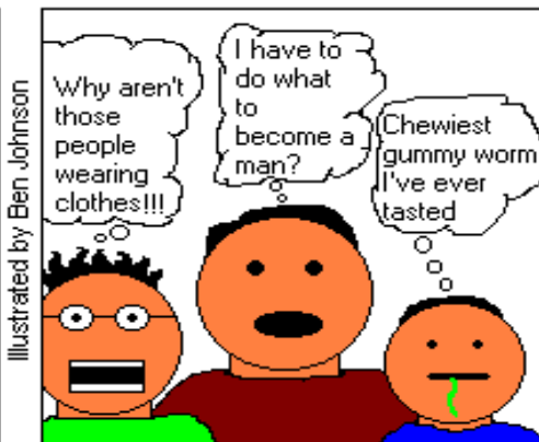
We were brought to the Jungle Camp where we learned to be like them.