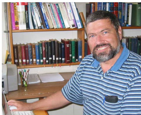
Applying technology to improve Bible translation speed & accuracy