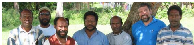
Church leaders in Kainantu pray for God's leading in Christian radio ministry