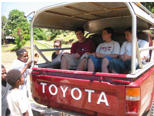
The best seats are in the back of the truck.

Raskols will often try to hold up cars on the road between us and the nearest city (Kainantu) and on other roads, including the Highlands Highway. They usually each have a bush knife (machete) and sometimes have one or more guns. Just because someone has a gun does not mean that they have bullets in the gun. Sometimes the gun has no bullets or the gun doesn't work anyway. Despite the fact that we have driven between here and Kainantu dozens of times, we have never been held up and we have only had one attempted hold up. When they attempted to hold us up, dad just floored the car and Ben waved at the guy with the gun from the back of the truck.